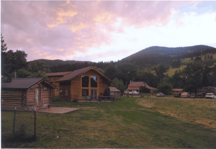
Black Tail Ranch

The Blacktail Ranch is an 8,000 acre retreat facility that has been providing quality accommodations since 1950. They have been continually upgrading and building to house the number of guests who have found their way to our door.