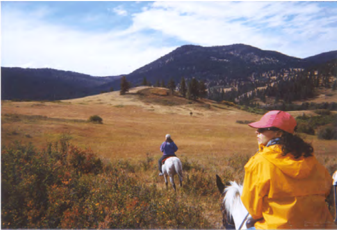
Riding with Nature